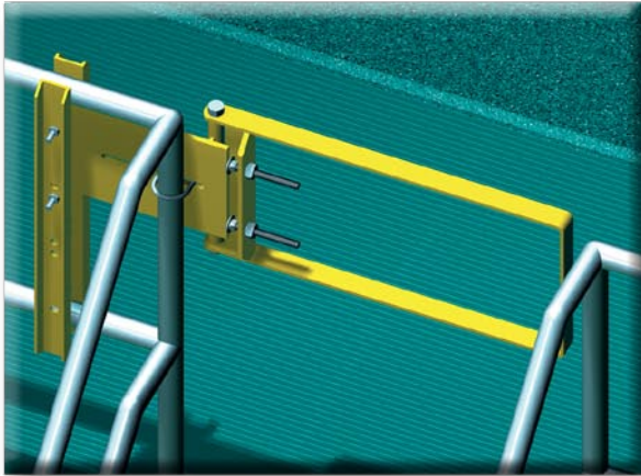
The A-71 Series: The choice of the Fortune 500