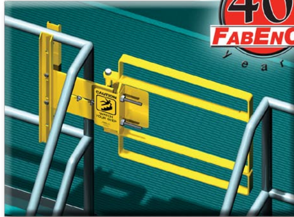
The XL Series: Our extended coverage gate