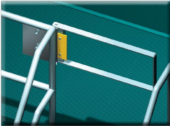
The R Series: Our low-cost, high-quality alternatives to “plastic” gates